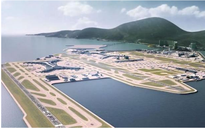
Third runway representation

Transforming your infrastructure into living assets